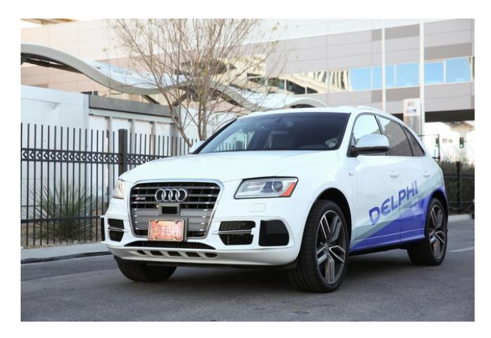
Figure 4 Delphi's automated Audi SQ5 SUV