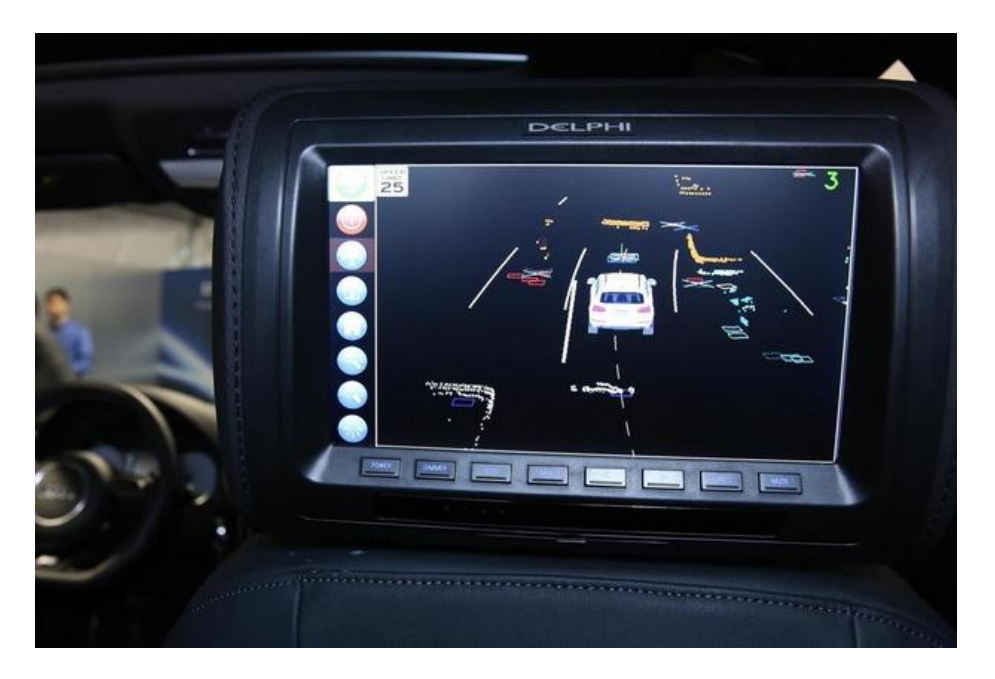
Figure 5 Built-in screen on Delphi's Audi SQ5 SUV