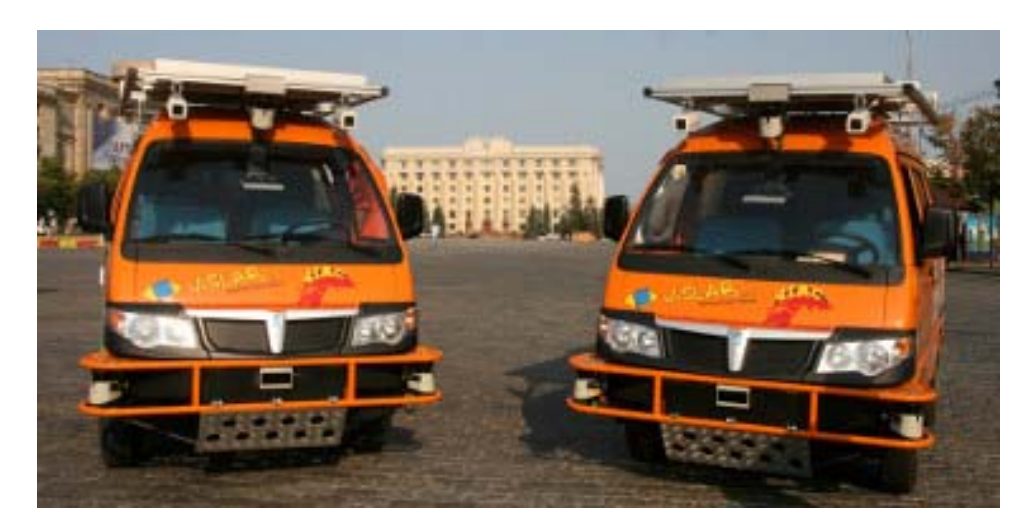
Figure 2 Twin VisLab vans