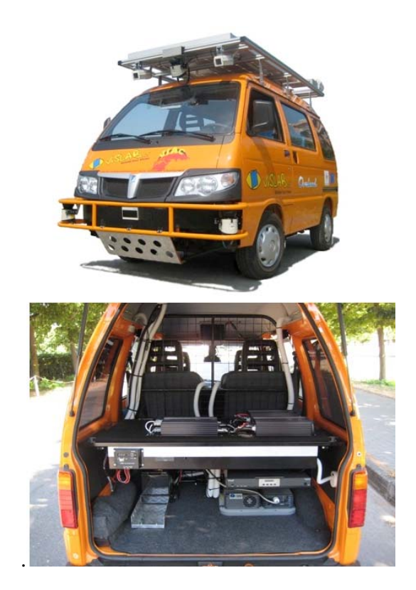
Figure 1 VisLab driverless van